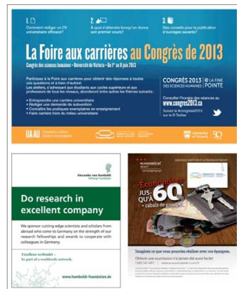
Sample: One half page ad (horizontal) and two quarter page ads (vertical).

Sample guides from previous years are available on request.