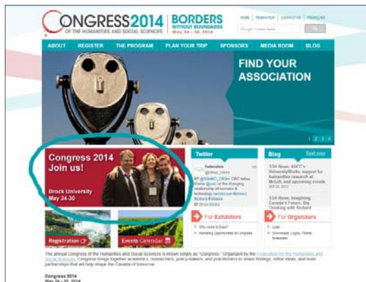
Web ad placement – Home page